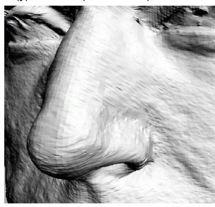
Head & Face Color 3D Scanner - Model PX, dual head configuration (left), sample data (center, right).